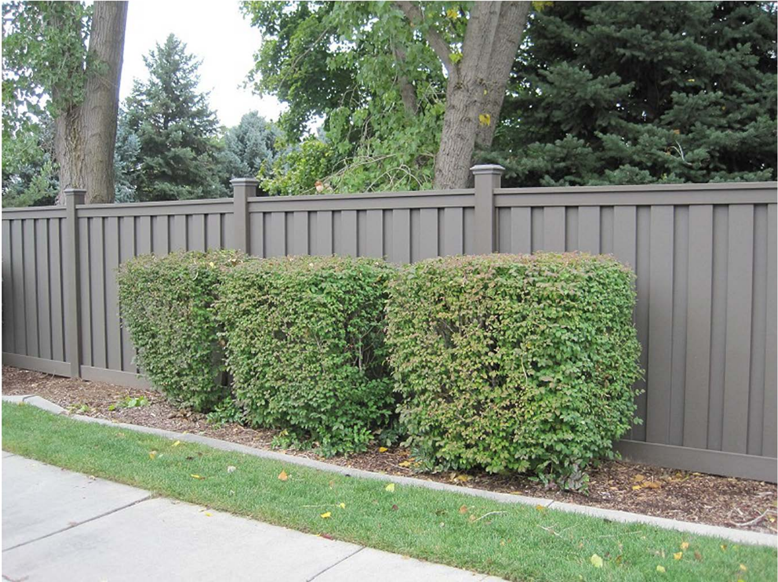
TREX Fencing - Winchester Grey