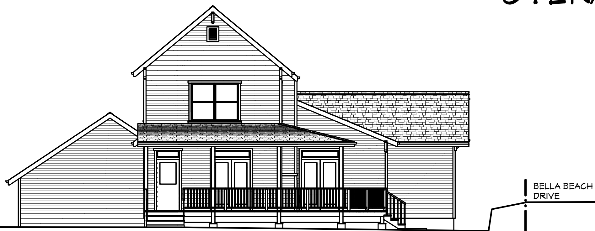
SOUTH ELEVATION 1/8" = 1'-0"