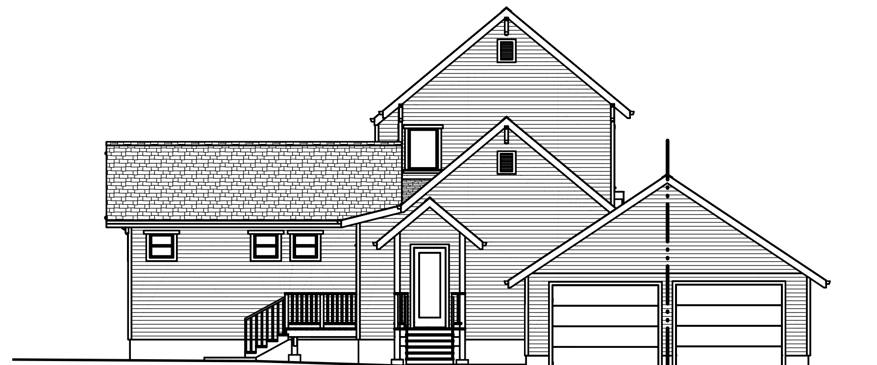
NORTH ELEVATION 1/8" = 1'-0"