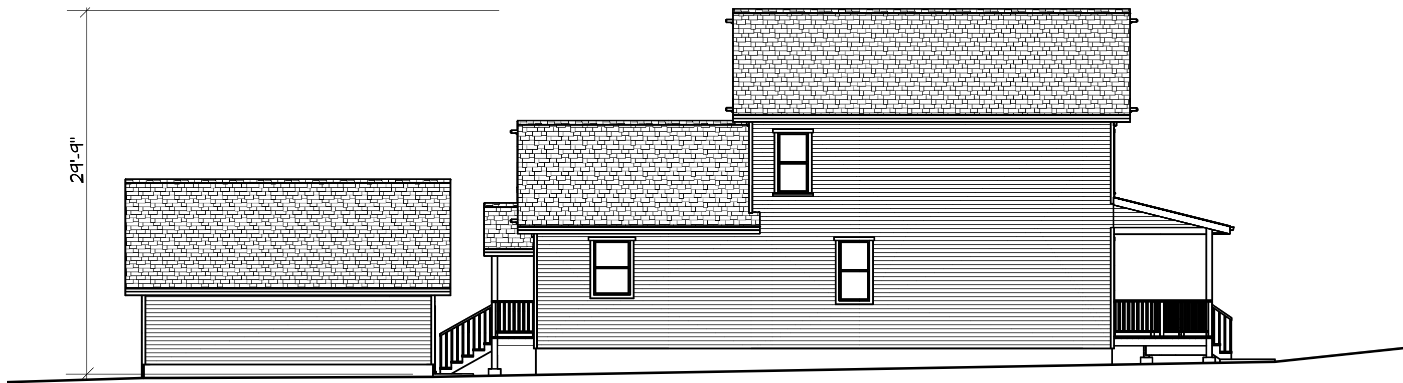
WEST ELEVATION 1/8" = 1'-0"