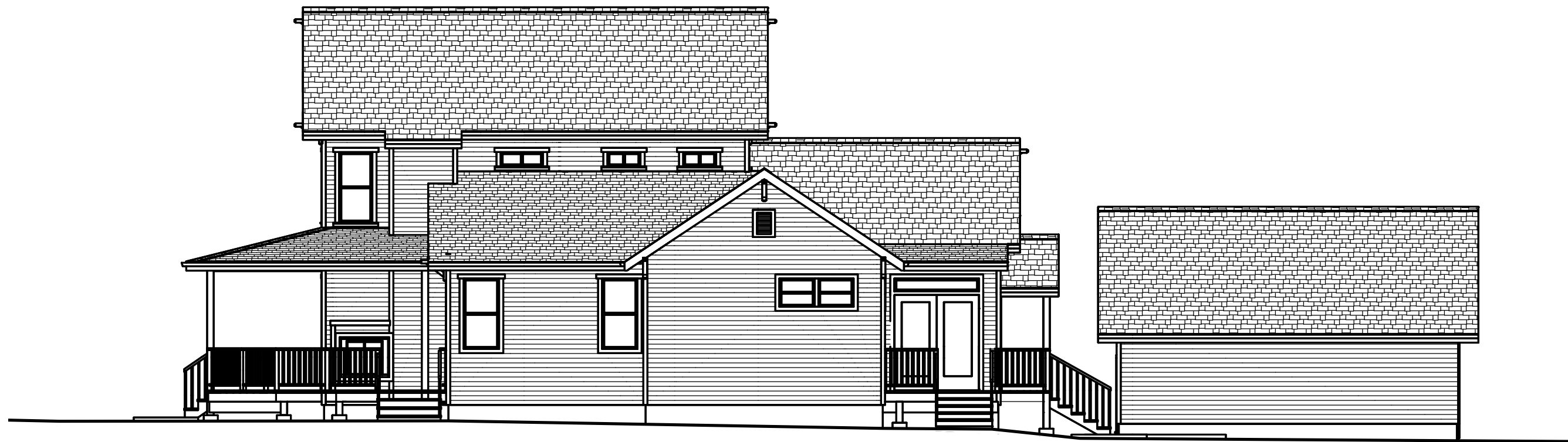
EAST ELEVATION 1/8" = 1'-0"